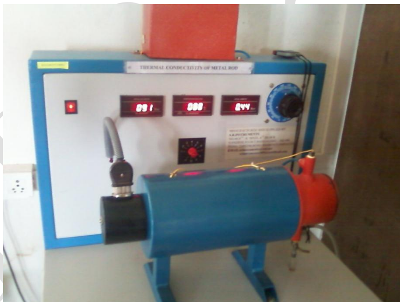
Fig. 1 Thermal Conductivity Apparatus

Thermal conductivity is a property of the material and may be defined as the amount of heat conducted per unit time through unit area, when a temperature difference of unit degree is maintained across unit thickness.