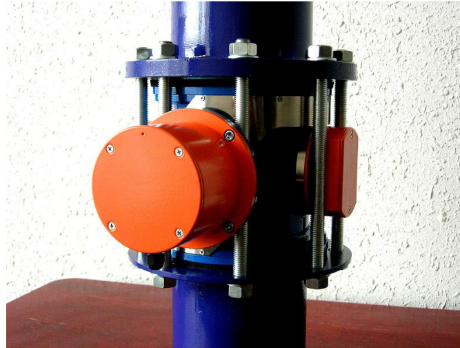
Fig. 3. The microwave sensor "A-344" in composition of pipeline