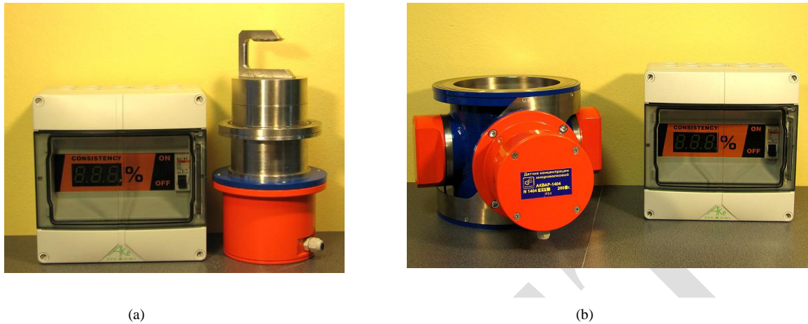
Fig. 1. Microwave sensors of concentration of paper mass in a water-paper pulp "A-343" (a) and "A-344" (b)