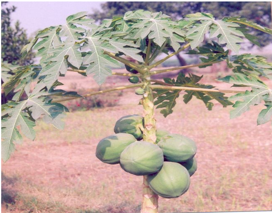
Plate- 3.2 Effect of alternate sprays of Boerhaavia diffusa / Clerodendrum aculeatum phytoprotein with bioenhancer milk protein on disease incidence in Carica papaya after 10 months of last spray

a. Untreated control plant showing severe viral disease symptoms and less fruit setting