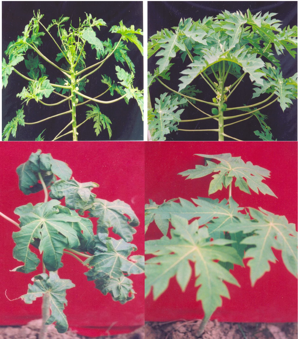
Plate- 3.1 Effect of alternate sprays of Boerhaavia diffusa/Clerodendrum aculeatum phytoprotein with bioenhancer milk protein on disease incidence in Carica papaya a. Untreated control plant showing severe viral disease symptoms at early stages b. Treated plant showing better growth and no viral disease symptoms c. Severe viral disease symptoms in untreated plant at reproductive stage d. Treated plant remained healthy at reproductive stage