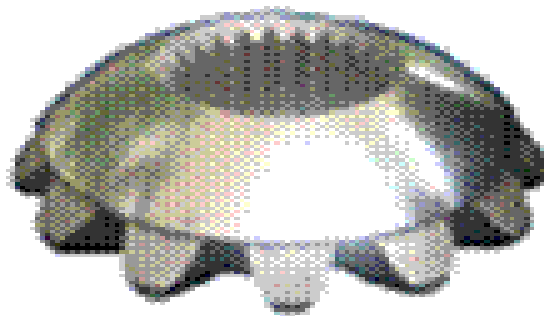
Fig1. Ford Gear

The study is done on ford gear component. The component undergoes many processes, such as forging, turning (profile cutting), drilling, boring, counter boring, heat treatment (core hardening), turning (profile cutting).Supreme Automech's operations are turning, drilling, boring.[2]