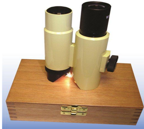
Fig 4 Crack detection microscope

working conditions. The image is focused by turning the knob at the side of the microscope and the eye-piece can be rotated through 360° to align with the direction of the crack under examination. The 4 mm range of measurement has a lower scale divided into 0.2 mm divisions. These 0.2 mm divisions are sub-divided into 0.2 mm divisions.