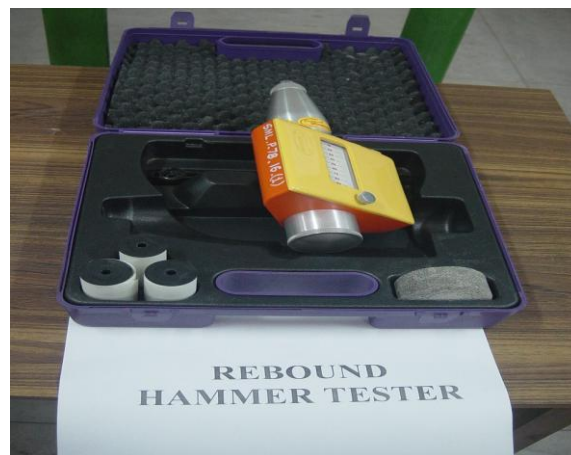
Fig 1 Rebound Hammer Test

The mass hits the shoulder of the plunger rod and rebounds because the rod is pushed hard against the concrete. During rebound the slide indicator travels with the hammer mass and stops at the maximum distance the mass reaches after rebounding. A button on the side of the body is pushed to lock the plunger into the retracted position and the rebound number is read from a scale on the body [13].