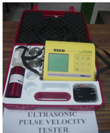
Fig 2 ultrasonic pulse velocity test

are the longitudinal waves, which are converted into an electrical signal by a second transducer [14-15]. Electronic timing circuits enable the transit time T of the pulse to be measured. The equipment consists essentially of an electrical pulse generator, a pair of transducers, an amplifier and an electronic timing device for measuring the time interval between the initiation of a pulse generated at the transmitting transducer and its arrival at the receiving transducer.