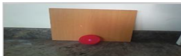
Fig 2: Processed image after detection of the obstacle

The Fig 2 represents the processed image of the detection of an obstacle even though the obstacle colour is red. This would prove the Path Planner accuracy level of working.