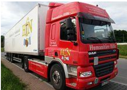
Truck for delivery of aid from Western to Eastern Europe