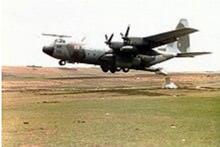
RAF C-130 airdropping food during 1985 famine

Early attempts were in private hands and were limited in their financial and organizational capabilities. It was only in the 1980s, that global news coverage and celebrity endorsement were mobilized to galvanize large-scale government-led famine (and other forms of) relief in response to disasters around the world. The 1983–85 famine in Ethiopia caused upwards of 1 million deaths and was documented by a BBC news crew, with Michael Buerk describing "a biblical famine in the 20th Century" and "the closest thing to hell on Earth". [37]