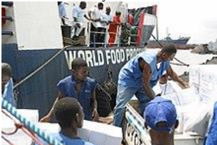
World Food Programme distributing food in Liberia

Humanitarian aid spans a wide range of activities, including providing food aid, shelter, education, healthcare or protection. The majority of aid is provided in the form of in-kind goods or assistance, with cash and vouchers constituting only 6% of total humanitarian spending. [50] However, evidence has shown how cash transfers can be better for