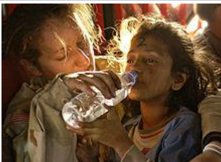
An American soldier gives a young Pakistani girl a drink of water as they are airlifted from Muzaffarabad to Islamabad following the 2005 Kashmir earthquake.

In addition to post-conflict settings, a large portion of aid is often directed at countries currently undergoing conflicts. [65] However, the effectiveness of humanitarian aid, particularly food aid, in conflict-prone regions has been criticized in recent years. There have been accounts of humanitarian aid being not only inefficacious but actually fuelling conflicts in the recipient countries. [66] Aid stealing is one of the prime ways in which conflict is promoted by humanitarian aid. Aid can be seized by armed groups, and even if it does reach the intended recipients, "it is difficult to exclude local members of a local militia group from being direct recipients if they are also malnourished and qualify to receive aid." [66] Furthermore, analyzing the relationship between conflict and food aid, recent research shows that the United States food aid promoted civil conflict in recipient countries on average. An increase in United States' wheat aid increased the duration of armed civil conflicts in recipient countries, and ethnic polarization heightened this effect. [66] However, since academic research on aid and conflict focuses on the role of aid in post-conflict settings, the