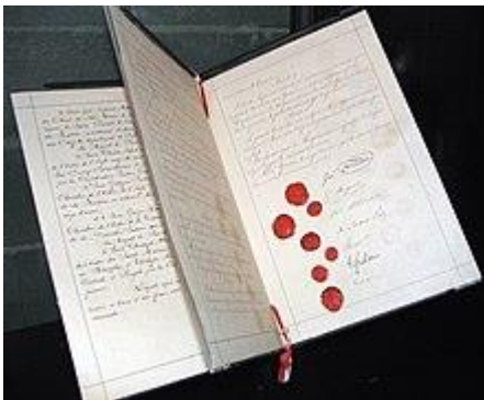
Original Geneva Conventions

symbol, and most importantly the indispensable neutrality of ambulances, hospitals, medical personnel and the wounded themselves. [27] Beyond this, in order to solidify humanitarian practice, the Geneva Society of Public Welfare hosted a convention between 8 and 22 August 1864 at the Geneva Town Hall with 16 diverse States present, including many governments of Europe, the Ottoman Empire, the United States of America (USA), Brazil and Mexico. [28] This diplomatic conference was exceptional, not due to the number or status of its attendees but rather because of its very raison d'être . Unlike many diplomatic conferences before it, this conference's purpose was not to reach a settlement after a conflict nor to mediate between opposing interests; indeed this conference was to lay down rules for the future of conflict with aims to protect medical services and those wounded in battle. [29]