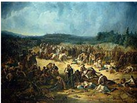
Henry Dunant at Solferino

The most well-known origin story of formalized humanitarian aid is that of Henri Dunant, a Swiss businessman and social activist, who upon seeing the sheer destruction and inhumane abandonment of wounded soldiers from the Battle of Solferino in June 1859, canceled his plans and began a relief response. [20] Despite little to no experience as a medical physician, Dunant worked alongside local volunteers to assist the wounded soldiers from all warring parties, including Austrian, Italian and French casualties, in any way he could including the provision of food, water, and medical supplies. His graphic account of the immense suffering he witnessed, written in his book A Memory of Solferino , became a foundational text to modern humanitarianism. [21]