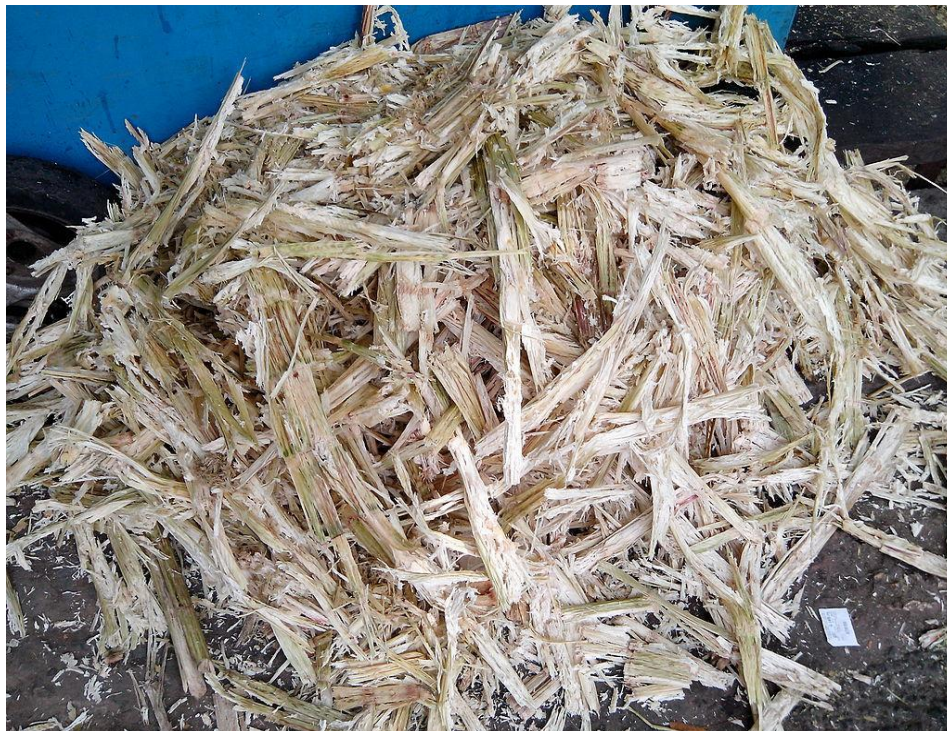
Fig.1 Sugarcane Bagasse

Although India is sparing little effort in developing its industrial sector, its economy will continue to depend on sugar production for many years to come. The sugar factories on their side will continue to depend entirely on bagasse burning for energy. The supply of bagasse ash is, therefore, ensured for years ahead.