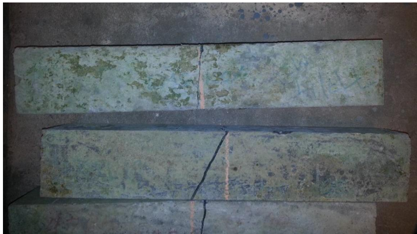
Fig 2: Crack width of beams

It was observed that the Flexural strength of SCBA 25% at the age of 7 days has decreased by 34.32% when compared with normal mix. It was observed that the Flexural strength of SCBA 25% at the age of 28 days has decreased by 29.35% when compared with normal mix. It was observed that the Flexural strength of SCBA 25% at the age of 90 days has decreased by 26% when compared with normal mix.