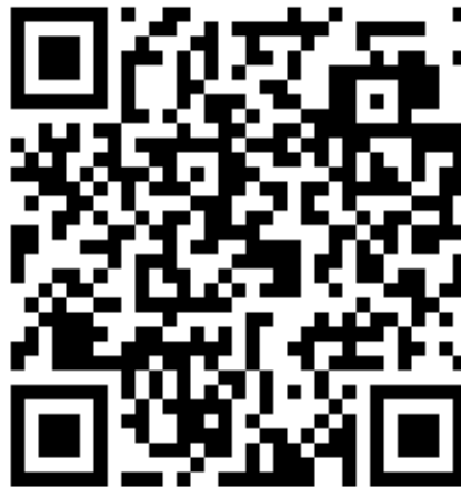
Fig(2). QR Code

ISO standard, market proven and completely measurable. QR codes allows average person to decode the QR code by scanning and read by a camera-equipped Smartphone when you've downloaded a scanner app [3].