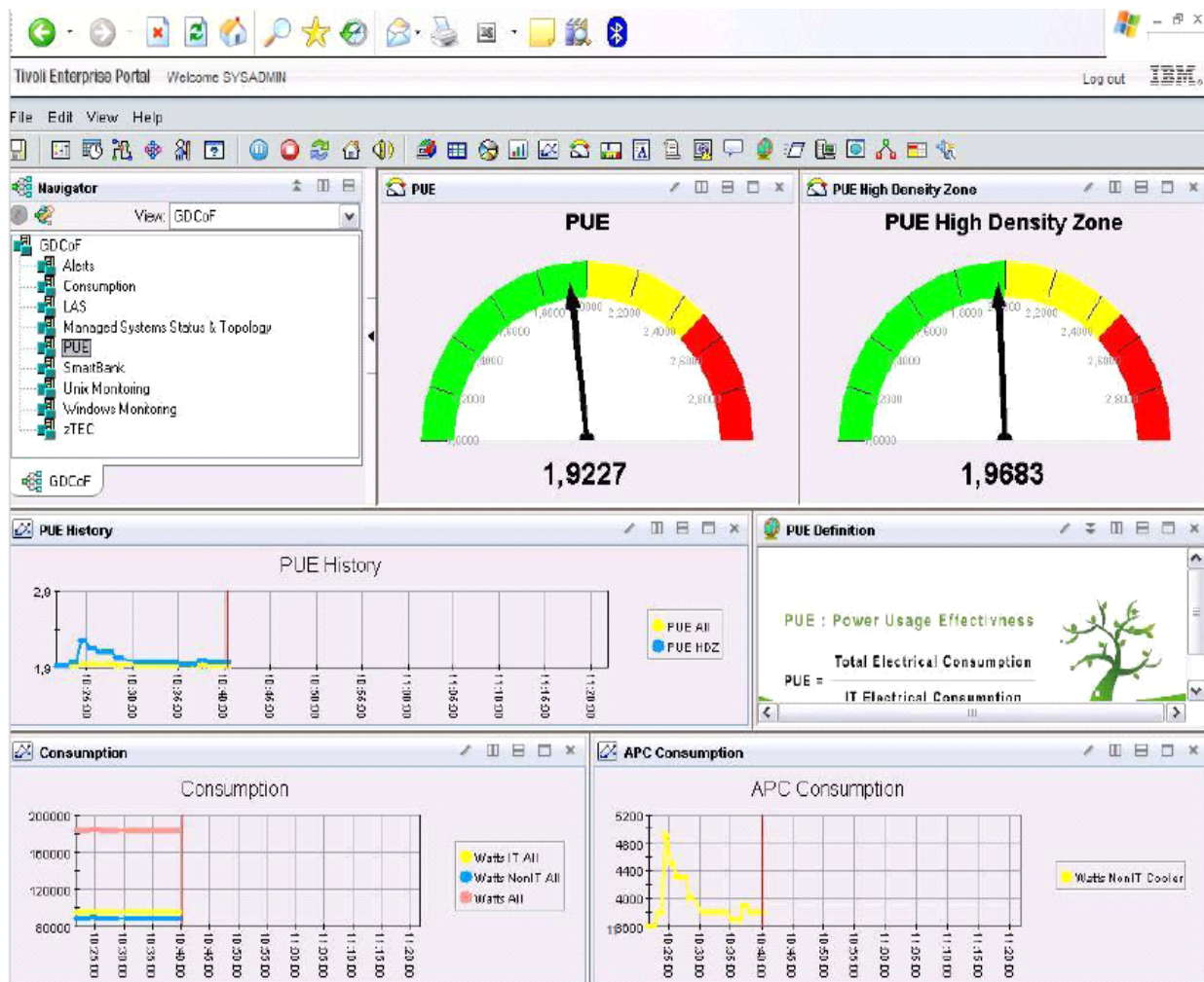
Figure 3: The interface depicting Power Usage Effectiveness