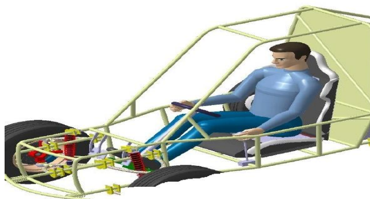
Fig: Proposed model showing free leg room area