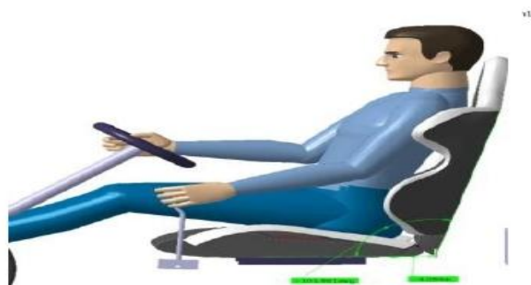
Fig: Driver seat adjustment angle (12.5degree)