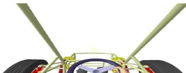
Fig: Ideal front visibility of the driver