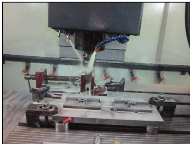
Figure 1: Photographic view of experimental setup for machining

Figures The experimentation was carried out at Morya Engineering, Satara on CNC vertical machining center (JYOTI VMC 850) having 12 kW power and maximum spindle speed of 8000 rpm. Figure 1 shows experimental setup for machining stainless steel 304 using end mill cutter. All experimental runs were carried out under wet condition. Maker of the insert selected for experimentation is KYOCERA; carbide insert LOMU 150508 ER-GH with tool holder MEW 1000-W750-15-2T having high cutting speed and long tool life with multi-layer MEGACOAT NANO (CVD) coating. Surface roughness after machining was measured using Mahr Perthometer M2 roughness tester. Roughness measuring principle of tester was based on stylus method having 0.5 mm/sec measuring speed.