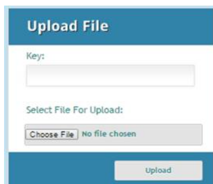
Figure 3: Data Uploading

The algorithm is implemented in java. When user uploading data, access allowance setting is done for each file. User details are made anonymous using k-anonymity as shown in Figure 6. The uploaded file will be encrypted using CP-ABE.