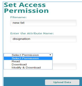
Figure 5: Setting Access Permission before uploading to cloud by data owner based on the attribute of the user for each file

This page is used for setting access permission before uploading to the file. They should provide filename and attribute name to upload the data. Data owner is responsible for providing the filename and attribute name.