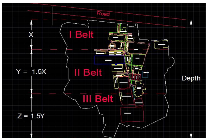
Fig 2.2: Belting Method

As the size and depth of the AERI campus is too large, we prefer the Belting method to calculate the value of the AERI campus. According to the Belting method, the whole part of the land is divided into three belts. The depth of First belt is suitably adjusted. The depth of second belt is kept 50% more than that of first belt and depth of third belt is kept 50% more than that of second belt.