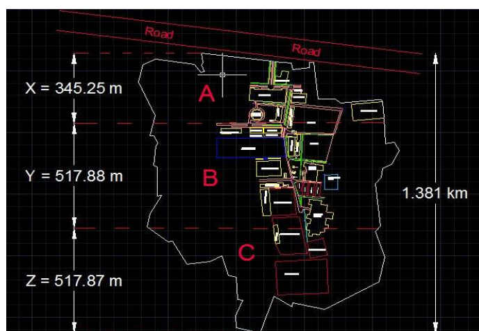
Fig3.1: BELTING METHOD OF AERI CAMPUS

As the size and depth of the AERI campus is too large, we prefer the Belting method to calculate the value of the AERI campus. According to the Belting method, the whole part of the land is divided into three zones. The market value of first zone of the AERI campus is Rs.800/- per square feet. The market value of the second zone of AERI campus is 75 % value of first zone value i.e., (0.75 \times 800 = \text{Rs.}600 \text{ /-}) and the market value of the third zone of the AERI campus is 50% value of the first zone value i.e., (0.5 \times 800 = \text{Rs.}400 \text{ /-}) . So the average prevailing market rate of AERI campus is Rs. 600 /- per square feet.