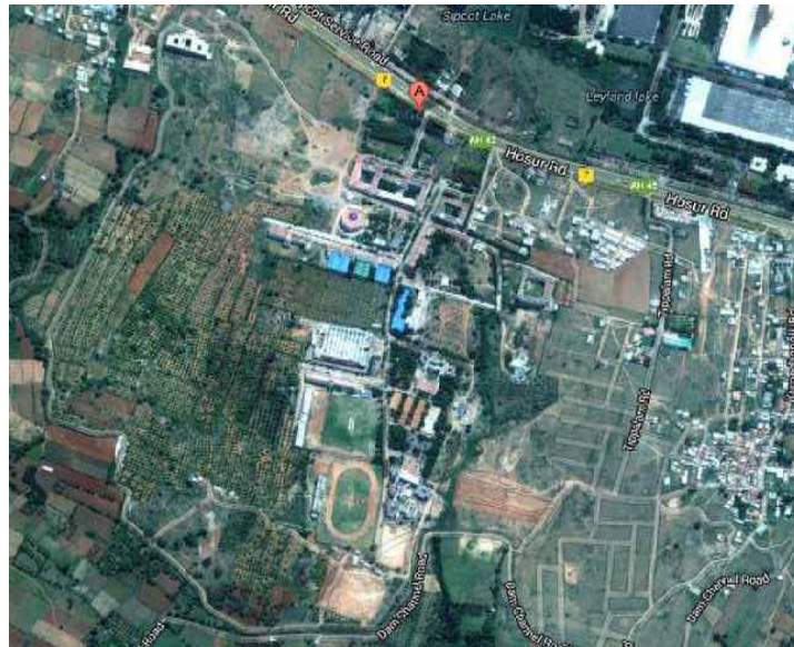
Fig 1.1: Satellite image of AERI Campus