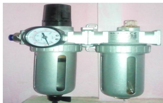
Photo No.2 FRL unit