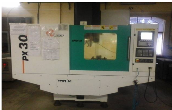
Photo No.1 CNC Milling Machine

In this experimentation Minimum quantity lubrication technique was used for lubrication. A precise amount of lubrication was fed in between tool & workpiece. To achieve mist formation Filter, regulator & Lubricator unit i.e FRL unit was used for operation shown in photo no.2. In this unit 6 bar air was regulated by regulator and then mixed with Servo cut lubricating oil to form mist, sprayed by nozzle in between tool & workpiece. The experiment was carried out at three cutting speeds, feed rate & constant depth of cut. The selected cutting speeds were 125,150,175 m/min, selected feed rate were 0.01,0.02,0.03 mm/tooth & selected constant depth of cut was 0.2mm.The experimental design model was made by using Response surface methodology method to investigate surface roughness on OHNS steel under Minimum quantity lubrication as shown in table no.1.