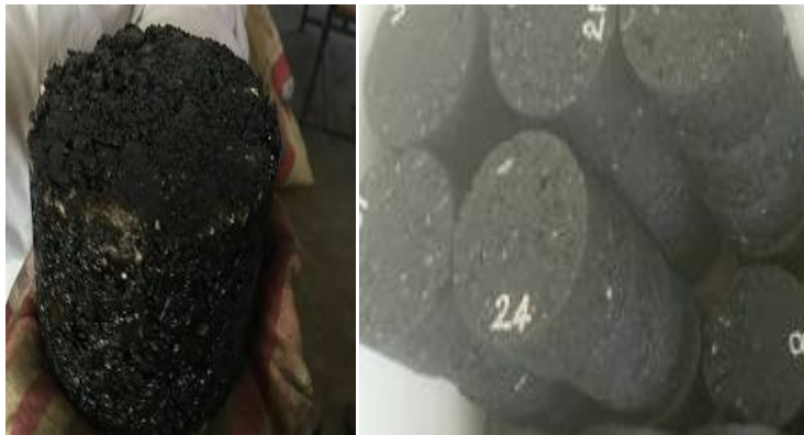
Fig 2:Bituminous moulds