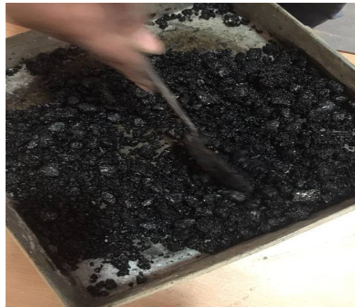
Fig 1: Bituminous mix