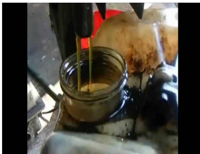
Fig:- Waste Fuel collected after mixing