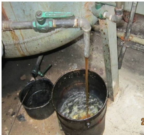
Fig:- Pyrolysis Fuel Collected

Plastic is not easily decomposable its affect in fertilization ,atmosphere ,mainly affect on ozone layer so it is necessary to recycle these waste plastic into useful things. The Agricultural waste is a large component of bio-degradable waste and it occupies large landfill area so an attempt has been given to use waste in total as a source of fuel.