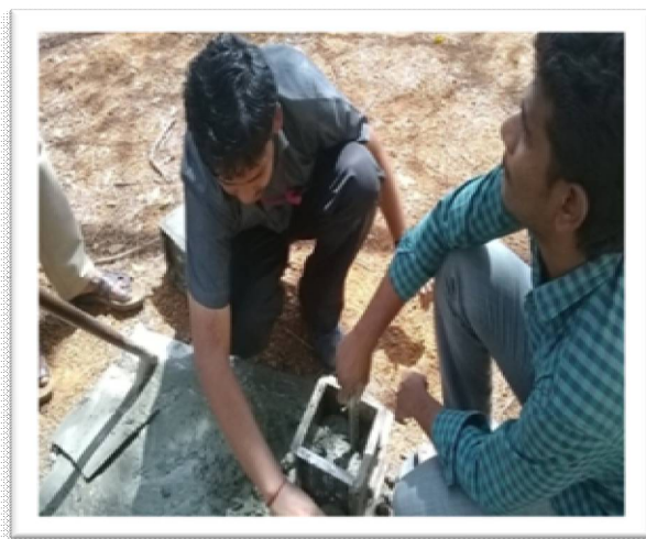
Fig.4 Casting of cube

This figure denotes that the synthetic plastic wastes which are cut into various random shapes are mixed with the dry cement, fine aggregate and coarse aggregate by means of volume batching. The plastics are added to the mix in terms of percentage such as 0.5 % , 1% & 1.5 % respectively.