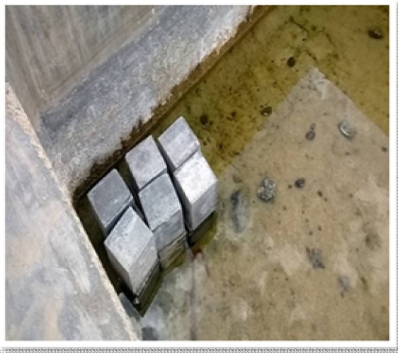
Fig.5 curing of specimen

After the concrete has attained the sufficient setting, they are removed from the Mould and the same is placed in the curing tank for curing process for 28 days