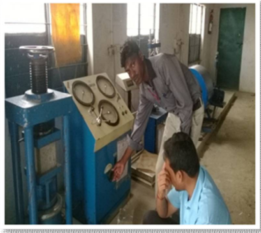
Fig.6 Test on a compression testing machine

After the concrete has attained the sufficient setting, they are removed from the Mould and the same is placed in the curing tank for curing process for 28 days