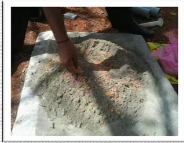
Fig.3 Mixing of SQF in concrete

After 7days, 14days and 28days, the cube specimens were removed from curing tank and taken for testing. Totally 27 cubes casted in which 9 cubes for 0% of SQF, 9 cubes for 1% of SQF and 9 cubes for 1.5 % of SQF. Totally 12 column was casted in which 6 specimens for solid column and 6 specimens for hollow column. In these test specimens 1.5% of SQF were added to the concrete and the specimens were tested.