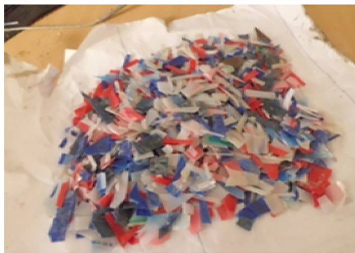
Fig.2 SQF (prepared by us from synthetic squanders)

This figure illustrates the samples of Synthetic (plastic ) wastes which are available at the site located nearer to Pudukkottai Sipcot plastic industry and the same is collected for the research along with domestic wastes from pudukkottai municipality