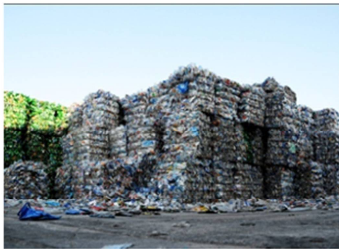
Fig.1 synthetic (plastic) wastes

Additionally, we consider another one criteria, that, the hollow sections are the most versatile and efficient form of construction and mechanical applications. Many of the strongest and most imposing structures in the world today would not have been possible without hollow sections.