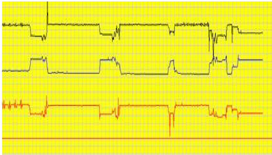
Fig.3: Abnormal vaibration of electrical machine

Hence, both the figures represents the vibrations that are measured on the motor. Fig (2) represents the normal vibrations of the machine whereas fig (3) represents the abnormal vibrations of the machines.