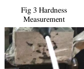
Fig 3 Hardness Measurement