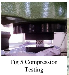
Fig 5 Compression Testing