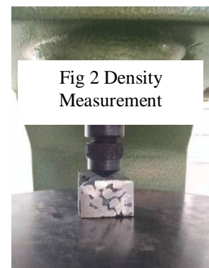
Fig 2 Density Measurement

temperature for sufficient 7075 was poured into the