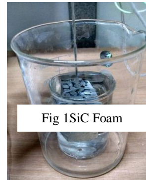
Fig 1 SiC Foam

Compression Testing - Universal Testing Machine was implemented in determining the compression strength of the metal-ceramic co-continuous composite as shown in Fig 5. The stress-strain graph was obtained for the composite and Young's Modulus was determined approximating the stress-strain relationship to be linear.