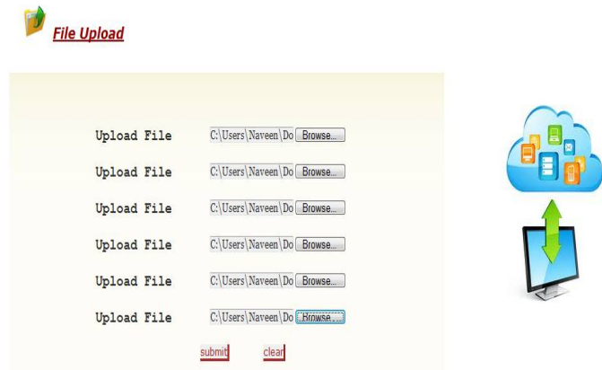
Figure 6: Upload Multiple File

After the dataowner login and select the page he will upload the file to the cloud. It may be of single file or multiple file.