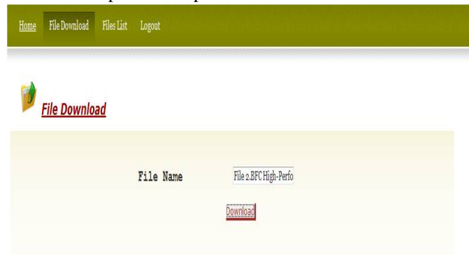
Figure 9: Downloading File

In this page dataowner will upload multiple files to the cloud and it must be of encrypted file.