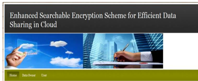
Figure 3: Home Page

The proposed system is implemented on eclipse. Here data owner can upload single file or multiple files. When uploading files to cloud an SSE key will be generated. Based on SSE key user can download the number of files as shown in below Figures. Generation of SSE key reduces the time consumption and improves the access performance.