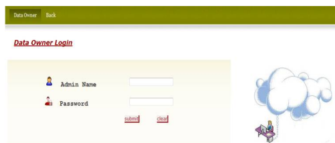
Figure 4: Data Owner Login Page

A home page or index page is the initial page of a website. Home page includes the option home, dataowner and user from that the further pages will be operated.