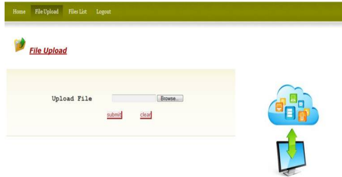
Figure 5: Upload Single File

It is the page where the dataowner will login to the page. It contains admin name and password from this page the admin can login and select the files and encrypt the files