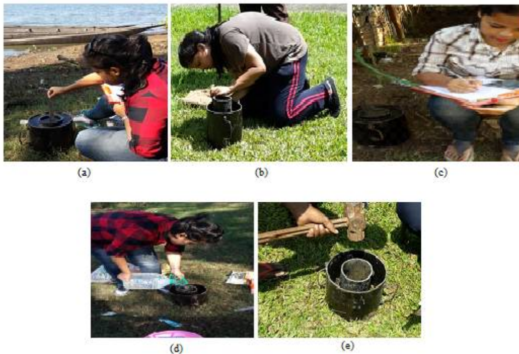
Fig 2: Some photographs while carrying out the experiment on sites (a) Measuring the drop in water level (b) Measuring whether the infiltrometer is levelled (c) Noting down the readings (d) Filling the cylinders with water (e) Digging the cylinders into the soil