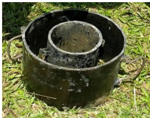
Fig 1: Double ring infiltrometer

Certain places of Guwahati like DeeporBeel, ADTU Panikhati, Eastern Retreat Panikhaiti, Zoo Road, Bonda and Narengi Housing Colony was selected to conduct the test by using double ring infiltrometer. Area of 2m by 4m was taken in all the places. The two cylinders are digged inside the soil but the measurement is taken in the inner cylinder only; the outer cylinder helps the water from the inner cylinder to flow vertically downwards and not laterally. The cylinders are of height 40cm which are been digged up to a height of 20cm inside the soil with the help of steel rod and hammer. Figure 1 shows the infiltrometer that has been used in this experiment with inner diameter 11cm and outer diameter 22cm.