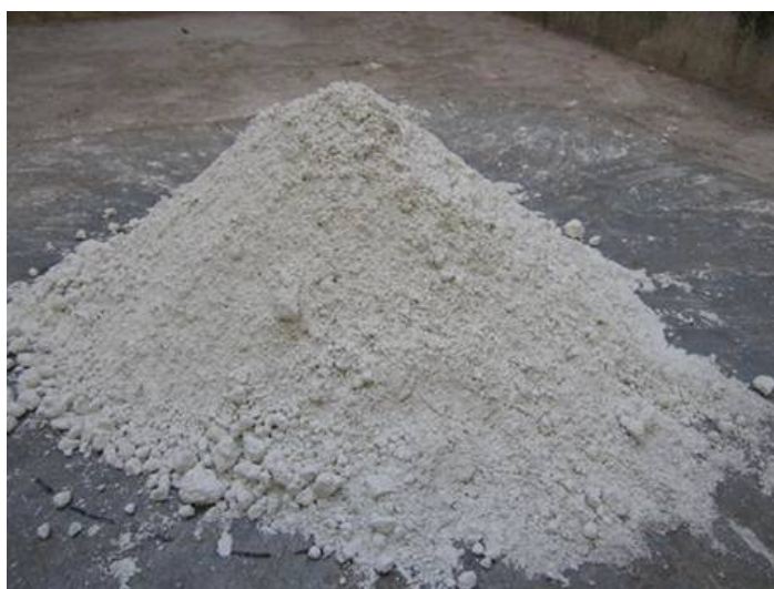
Fig 1. Hypo Sludge