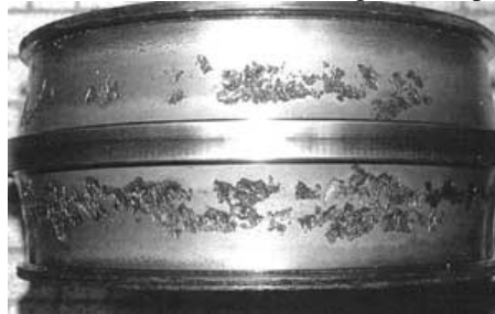
Fig. 2 Ring of bearing damage due to overloading.

Overloading is one of the leading causes of bearing failure. Over loading that means over stress symptoms are denting of the bearing raceways and balls or rollers resulting in high vibration and wear. Contaminants include airborne dust, dirt or any abrasive substance that finds its way into the bearing. Principal sources are dirty tools, contaminated work areas, foreign matter in lubricants or cleaning solutions. Clean work areas, tools, fixtures and hands help reduce contamination failures. Keep grinding operations away from bearing assembly areas and keep bearings in their original packaging until you are ready to install them. Seals are critical-damaged or inoperative seals cannot rot bearings.