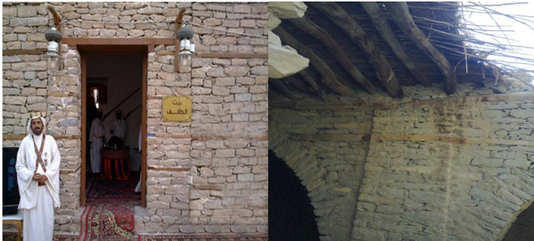
Fig – 3 Old House in Taif Fig – 4 Arch & Column by Stone Structure