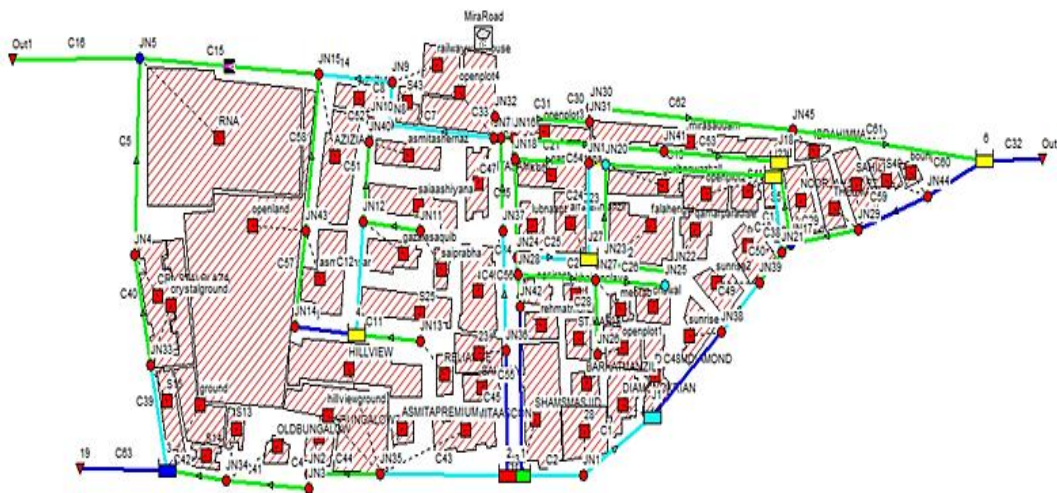
Fig. 4 Drainage Condition for Redesigned Channels

The simulation result obtained as shown below for redesigned model shows that flooding can be avoided at most of the places just by increasing depth.