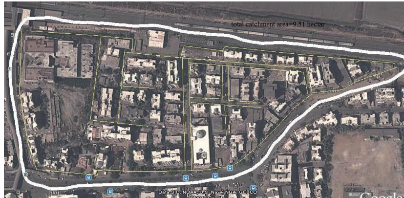
Fig. 1 Map of the Study Area