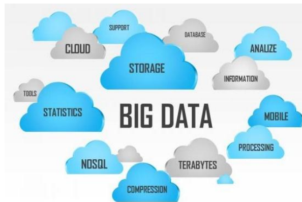
Fig1. Big Data

The origin of the term ‘Big Data’ is due to the fact that we are creating a huge amount of data every day. At the KDD Big Mine 12 Workshop Usama Fayyad in his invited talk presented amazing data numbers about internet usage, among them are the following: each day Google has more than 1 billion queries, Twitter has more than 250 million tweets per day, Per day Face book has more than 800 million updates, and YouTube has more than 4 billion views per day. Big Data is a heterogeneous mix of data both structured (traditional datasets –in rows and columns like DBMS tables, CSV’s and XLS’s) and unstructured data like PDF documents, e-mail attachments, images, manuals , medical records such as x-rays, ECG and MRI images, forms, rich media like graphics, video and audio, contacts, forms and documents. Businesses are primarily concerned with managing unstructured data, because about 80 per cent of enterprise data is unstructured [3].