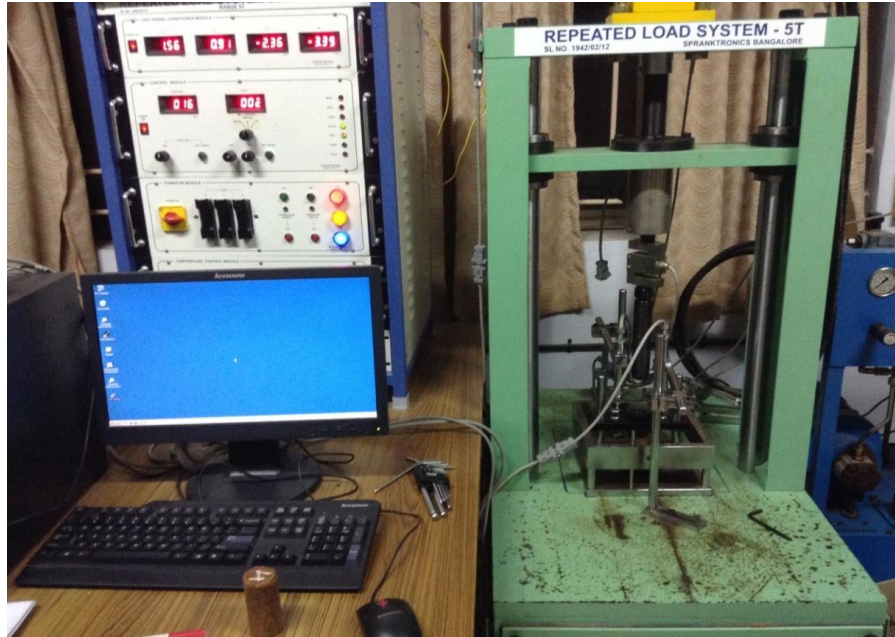
Fig. 2. Experimental Setup for Fatigue Test

The cylindrical sample was mounted on the loading frame and the Deflection sensing transducers (LVDT) are set to read the deformation of the specimen. The load cell is brought in contact with the specimen surface. In the control unit through the dedicated software, the selected loading stress level, frequency of loading and the type of wave form are fed in to the loading device. The loading system and the data acquisition system is switched on simultaneously and the process of fatigue load application on the test specimen is initiated. The repeated loading, at the designated excitation level (i.e. at the selected stress level and frequency) is continued till the failure of the test specimen. The failure pattern of the test specimen is noted down manually.