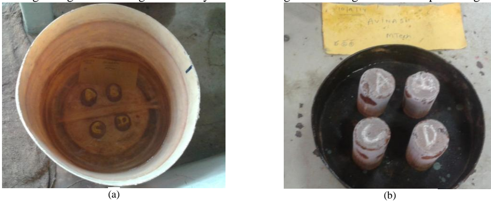
Fig.1. Durability Tests on soil (a) Durability Samples immersed in water (b) Durability samples after freezing