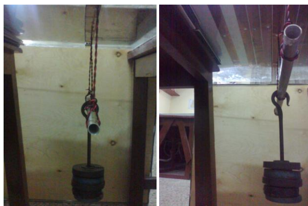
Fig. 5 Experimental arrangement for strength measurement of glued readout strip of the pickup strips panel.

Other experimental requirement is that these strips remain attached for a very long time and also we should know about strength of the connections. Connections made should not be affected by any kind of jerks and should last longer. For getting the answer of above mentioned curiosities, we have performed tests to check the strength of the attachment. For this purpose, we have arranged an experimental setup as shown in Fig. 5. In which we have hung some weights through the wires being soldered on the under test readout strips. We adopted gluing procedure as mentioned in sec. II. Here we soldered the wire to the strip made using a known adhesive as listed in Table 1 at three places over the strip and hung the weights in increasing order as shown in Fig. 5. The above mentioned procedure has been applied for each strip. The maximum weight is continuously hung for maximum time of 3 hours. The results of the above test are tabulated in Table 1.