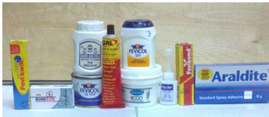
Fig. 2 Photographs of few adhesives used in making the readout strips panel.

We have searched for various adhesives available in our local market (so that it can be available very easily). We found that Band Aid Col (wood fixer, PVA emulsion), Bluecoat 9000 (Synthetic wood adhesive), Fevicol SH, Fevicol SR 998 (Synthetic rubber adhesive), Fevi Kwik, Fevibond, GRL Tyre and tube repair, Bondtite, Flex Kwik and Araldite are possible locally available adhesives. The photographs of these adhesives have been shown in Fig. 2. Brief information about these adhesives has been listed in Table 2.