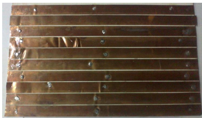
Fig. 3 Test readout pickup strips panel made up by using different adhesives.

Using these adhesives we have made up a test readout strips panel for further experiments, as shown in Fig. 3. In its making we have attached Copper strips using the above mentioned different adhesives. But for making its ground plane (by attaching the Aluminium foil) we have used the Araldite as a common adhesive, because it has good attaching property. After attaching them we have pressed the panel's strip with some weights using lead bricks for 24 hours.