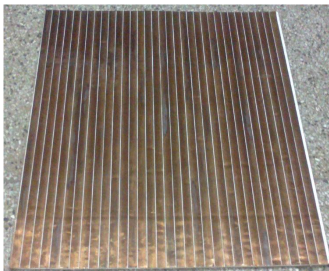
Fig. 1 Image of 1 m × 1 m Silicon Fiber Sheet based readout strips panel.

Since, we have tested that Araldite is a very strong adhesive although its cost is very high. In this paper we have described the experiments by which we have chosen the appropriate adhesive for our purpose of making the readout strips panel at a large scale. This work will be basically useful not only for INO-ICAL (Iron Calorimeter) experiment but also for other experiments in which they need to attach the metallic foils. If attachment work is very small then use of the Araldite adhesive may be preferred because it is very well known and well tested adhesive for attaching very hard materials such as Iron sheet, Glass sheet and Stones etc [3].