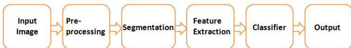
Fig. 1: Overview of system.

Figure 1. depicts the overview of the system. It shows the sequence of steps that are to be followed for the efficient classification of Acute Myelogenous Leukemia. The system has four main stages viz. pre-processing stage, segmentation stage, feature extraction stage and classification stage. In pre-processing stage the unwanted noise content present in the image is removed. Also the RGB image is converted into L^*a^*b color space image. Pre-processing stage is followed by the segmentation stage which uses k-means clustering. After that features are extracted in feature extraction stage which majorly uses LBP and HD. This is followed by the classification stage which uses SVM. Finally validation is performed.