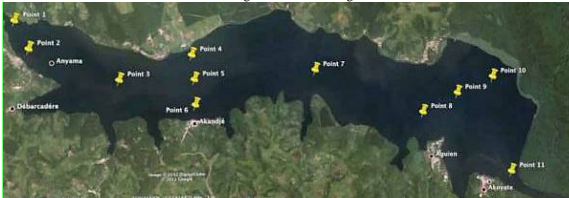
Fig.1: Sampling locations map

to investigate the possible influence of Mé river on biological communities of lagoon. Stations were selected nearest DjibiBete and Mé rivers to assess the rate of exchange in different backgrounds.