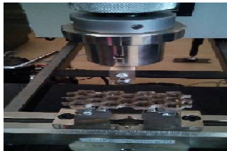
Fig.3 flexural test specimen under loading.

Figure-3 shows the Specimens position under loading in 3-point bending apparatus. At least five specimens of each honeycomb core structure (core thickness t=2.022 \pm 0.100 mm) were tested using the Instron 4467 universal test machine.