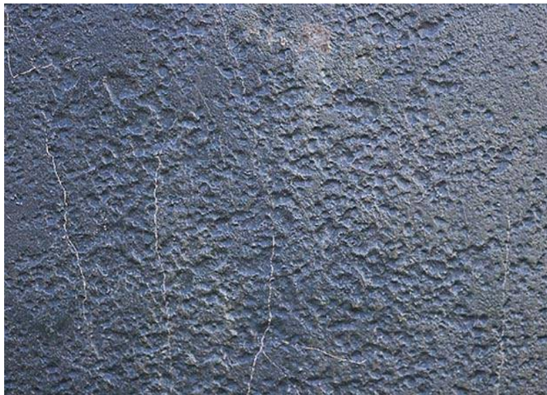
Figure 1– pitting action in wall of impeller due to cavitation

The end result of cavitation is the collapse of the vapor bubbles inside the pump, which can cause several problems. The first problem is a reduction in the pumping capacity of the pump. If the pump is unable to keep up with the incoming flow, then an overflow situation may occur. Cavitation also causes damage to the pump. The collapsing vapor bubbles can cause excessive vibration, which can cause rotating parts, such as the impeller, to contact non-rotating parts, such as the wear plates or wear rings, causing damage. Excessive vibration may also cause premature failure to mechanical seals and bearings. Cavitation can also damage the wetted components themselves from contact with the imploding vapor bubbles. In these instances, the energy that is released when the vapor bubbles implode causes pieces of the metal to break off and collide with other moving parts. The damage typically occurs to the impeller and can severely reduce the operating life of the pump.