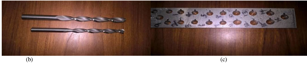
Fig. 2 Experimental set up: (a) Radial drilling machine (b) cobalt drill bits (c) Specimen after drilling.