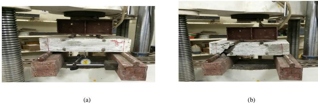
Fig.3: (a) Test setup for flexural test, (b) Cracks formed in the panel

After 28 days from the date of casting, the test specimen is tested for flexural strength using four point loading system. The load is given as shown in the figure.