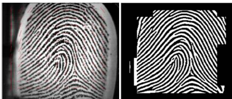
Fig. 6 Ridge orientation image