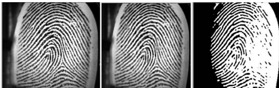
Fig. 3 Original image

Figures show the results of noise removal from an image by using firefly algorithm to improve the significant feature selection process. The input is given as original latent fingerprint image and fingerprint to be enhanced, also consider the Gabor dictionary. Image is decomposed by the TV model and the multi-scale patch based sparse representation is iteratively applied on original latent fingerprint image to construct the high quality fingerprint image. After apply firefly algorithm to optimize the ridge segmentation for better ROI extraction by selecting best threshold and best block size and obtain enhanced fingerprint image