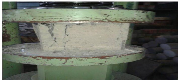
Failure pattern of Geopolymer concrete cube in compressive testing machine

Graph 1. Show the effect of temperature on compressive strength of Geopolymer concrete at various temperature conditions. It is observed that temperature plays vital role for polymerization of Geopolymer concrete. For 60°C the compressive strength of Geopolymer concrete is less compared to 120°C. As the temperature increases, strength also increases but after 18 hours duration strength will gradually increase and few cases it will decreases. Due to this the curing time is well or good in between the 18 hrs to 24hrs. It was also observed that the compressive strength of Geopolymer concrete increases with increase in duration of heating. But the rate of gain of strength is reduces after 24 hrs for 120°C of heating. For the 90°C temperature the rate of gain of compressive strength after 18 hours increases slightly.