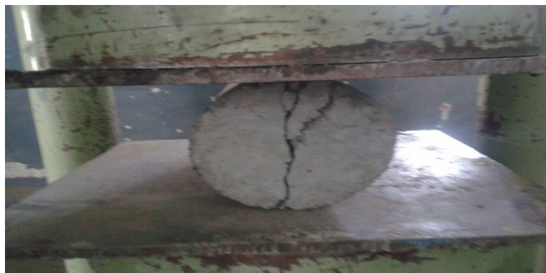
Failure pattern of Geopolymer concrete cylinder in compressive testing machine

Graph 2. Show the effect of temperature on split tensile strength of Geopolymer concrete at various temperature conditions. For the polymerization the 6, 12 hours is less period. The curing time increases up to 18 hours the split tensile strength will also increases but after 18 hours it will increases slowly and for 120°C the strength will decrease or sometimes it will remains same. The behavior of 120°C graph shows that the overheating reduces the strength.