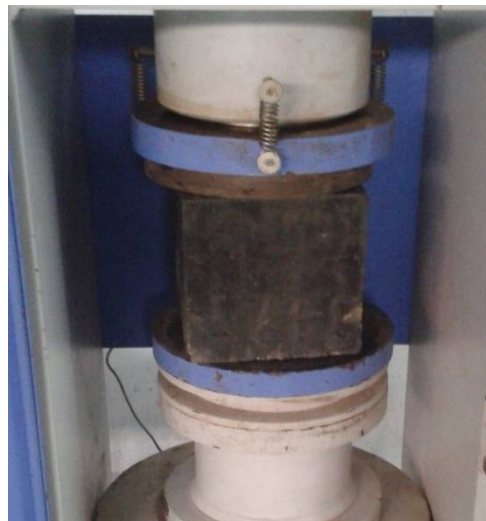
Fig 3. Compression testing of cube specimen

From the Fig 2 it is clear that M7 mix containing 30% tile aggregate and 10 % dolomite gives greater strength as compared to other mixes. The maximum compressive strength of concrete containing 30% of tile aggregate and 10 % of dolomite was found to be 35 N/mm 2 .