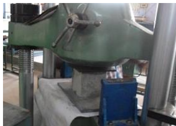
Figure 4.6 Compressive Strength Test

A - Cross sectional area of the specimen