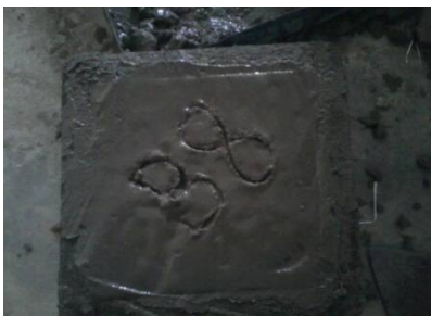
Figure 4.2 Mixing of materials

Demoulding: The casted specimens are demoulded in such a way that there is no possibilities of damaging of specimens.