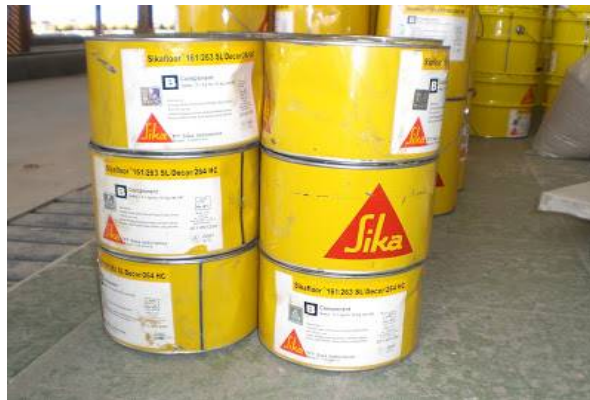
Figure 1.2 SikaCrete

The large family of Sikacrete represents some of the highest performance resins of those available at this time. Sikacrete generally out-perform most other resin types in terms of mechanical properties and resistance to environmental degradation, which leads to their almost exclusive use in aircraft components. As a laminating resin their increased adhesive properties and resistance to water degradation make these resins ideal for use in applications such as boat building. Here Sikacrete are widely used as a primary construction material for