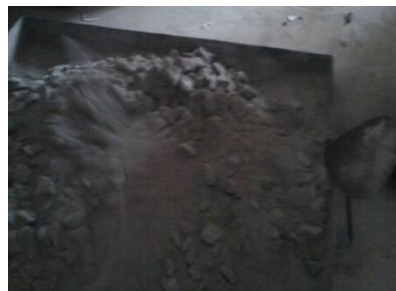
Figure 4.3 casting of cube