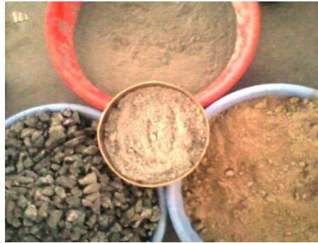
Figure 4.1 Material collection

Preparation of mould: The mould for prism, cube and cylinders were collected and they are properly checked for their dimensions. Crude Oil can be applied to inner side of the moulds for the smooth replace.