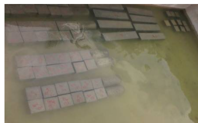
Figure 4.5 Curing of Specimen

Curing: 28 days curing achieve strength. Water curing is used for recycled coarse concrete. Curing concrete can be defined as a chemical process that ensures the hydration of cement in newly placed concrete. The curing process is part of the chemical reaction between Portland cement and water to hydrate the product, creating a gel that can be laid down only in water-filled space. It usually involves the control of moisture loss and the temperature affecting the hydration process.