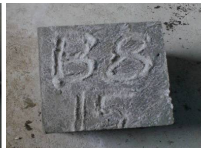
Figure 4.4 Demoulding of cube

Curing: 28 days curing achieve strength. Water curing is used for recycled coarse concrete. Curing concrete can be defined as a chemical process that ensures the hydration of cement in newly placed concrete. The curing process is part of the chemical reaction between Portland cement and water to hydrate the product, creating a gel that can be laid down only in water-filled space. It usually involves the control of moisture loss and the temperature affecting the hydration process.