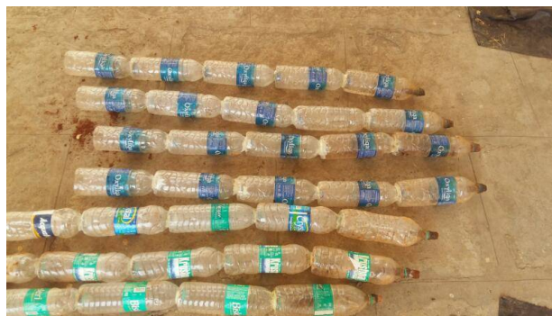
Figure 6: Actual Photograph showing Mud-Cocks Inserted in Bottles.

By taking raw brick mud such cylindrical shaped cocks were made & let them bake at 950°C for 24 hours. After drying it was then inserted into a last bottle of series & made it water tight by applying adhesive. Here after water is filled in bottles its percolation rate will be decreased due to low porosity of mud cocks.