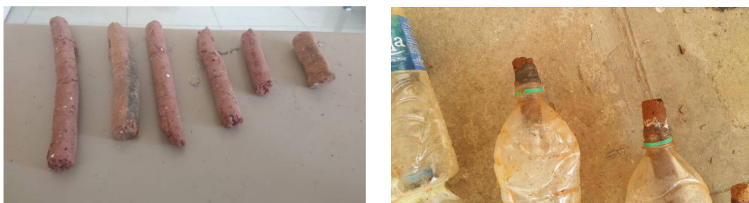
Figure 5: Construction of Brick-Mud Cocks

Interconnecting bottles by making hole at bottom of bottle and inserting another bottle into it, in this way a series of 5 bottles were made. Such 27 series were made to ensure the requirement. Side by side the upper portion of upper layer of bottle is cut down horizontally which makes path to enter rainwater as well as through conventional means. By changing the capacity of bottles (500 ml, 1litre, 2 liters etc) or by modifying the numbers of bottles attached to frame, the total water carrying capacity of safe guard tree can be modified.