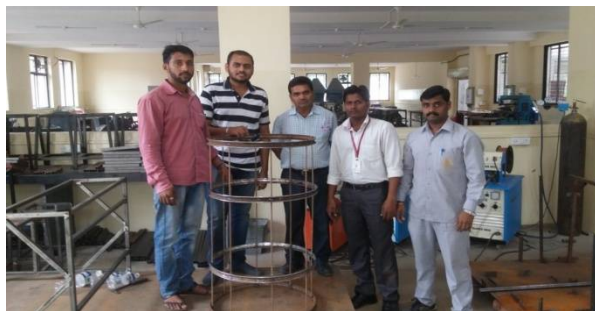
Figure 2: Construction of Frame.