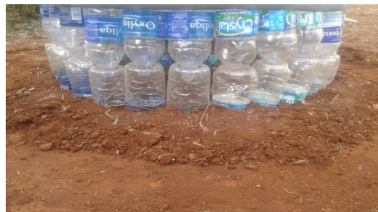
Figure 7: Actual Photographs of Model