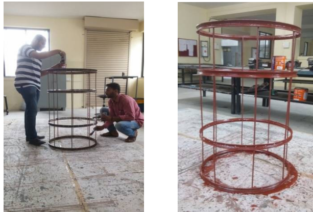
Figure 3: Application of Red Oxide Coating on Frame.