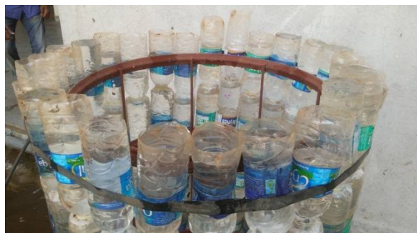
Figure 8: Bottles Full of Water

The last layer of bottles is inserted into ground about 10 to 12 cm to ensure that the water seeps through vertical direction only which in turn results in increase in ground water table.