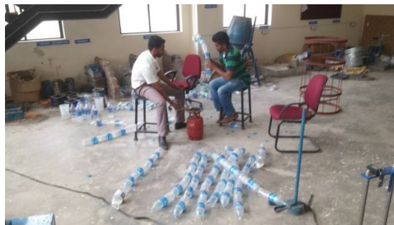
Figure 4: Interconnection between Bottles.

Application of red oxide paint was done in case to avoid rusting of frame in moisture conditions & for good appearance.