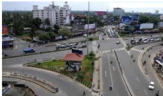
Fig. 2. Vytilla junction