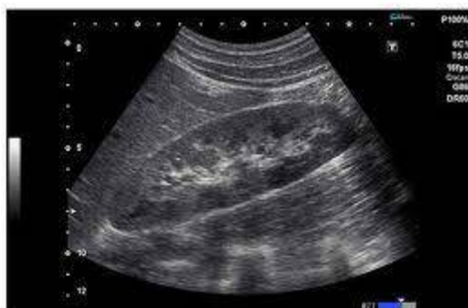
Fig: 1: ultrasound image corrupted by the speckle noise

Medical images are often deteriorated by noise due to various sources of interferences and other phenomena that affect the measurement processes in imaging and acquisition system. Speckle noise occurrence is often undesirable, since it affects the tasks of human interpretation and diagnosis. It is used for imaging soft tissues in organs like spleen, uterus, liver, heart, kidney, brain etc. gnosis. On the other hand, its texture carries important information about the tissue being imaged. This paper to developing in the Kidney images.