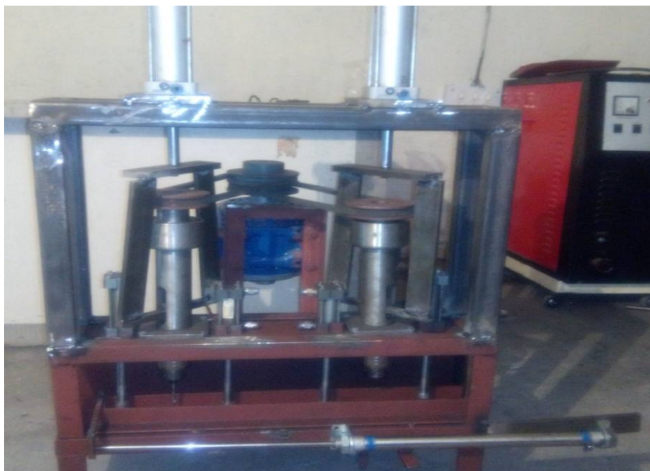
Figure 2: Fabricated Machine

After completion of drilling operation, the mechanism is used to push the workpiece at riveting tool. Then work piece is clamped by the two separate pneumatic small cylinders by passing the air from valve V5. Then a rivet is inserted on predrilled hole. The rivet tool spins about 3^{\circ} - 6^{\circ} offset projecting out of the joint thereby cold forming the head on the rivet side. The orbiting tool rotates at a fixed angle during orbital forming and applies both axial and radial forces to progressively move malleable material into a desired shape by passing the air from valve V3. After completing the riveting operation the rivet tool retracts to its original position.