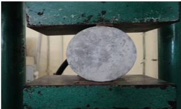
Fig 5.4 Specimen for Split Tensile Strength of Cylinders

The test was carried out according to IS 5816-1999 to obtain the splitting tensile strength of M25 grade of SCC concrete. The test results of different types of concrete are presented. Tensile strength of silica fume in SCC is slightly decrease, when compared to convention concrete. As replacement level of silica fume increases there is an decrease in splitting tensile strength.