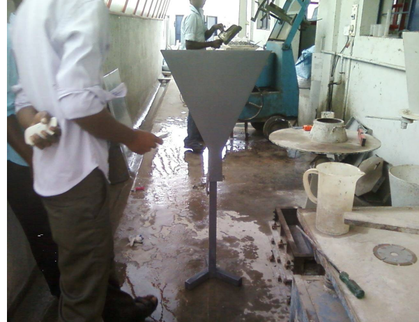
Fig.5.2 Workability Test (V-Funnel)