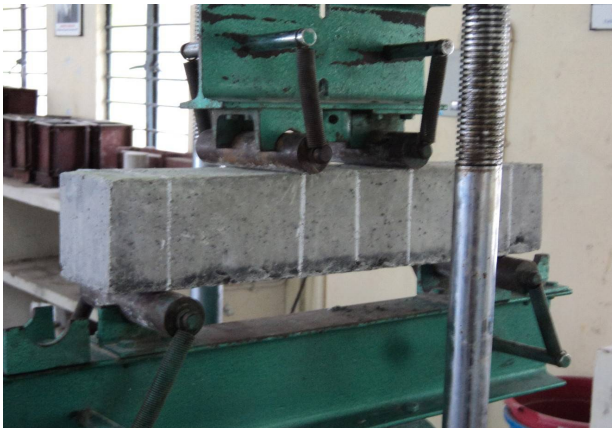
Fig 5.6 Specimen for Flexural Strength of Beam

Flexural strength test was carried out according to IS 516-1959. Flexural strength of silica fume in SCC is slightly decreases when compared to conventional concrete.