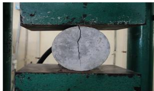
Fig 5.5 Failure of Split Tensile Strength of Cylinders