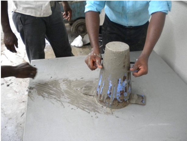
Fig.5.1 Workability Test (Slump Flow)