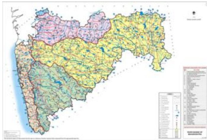
Fig. 2. River Map of Maharashtra