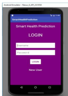
Fig.1: Login Page

In Login form enter Username and Password and enter into the system shown in fig.1. In the Registration form register the new patient and fill the personal information. Enter the patient name, gender email address like that fig.2. In disease prediction form enter symptoms and show related disease the system shows the appropriate doctor and then goes to the notification for doctor for visited patient. Login button is close the session fig.3. In that symptoms form show patient list and doctor profile and as well as admin add the diseases and related symptoms. Then profile part shows the patient and doctor profile fig.4