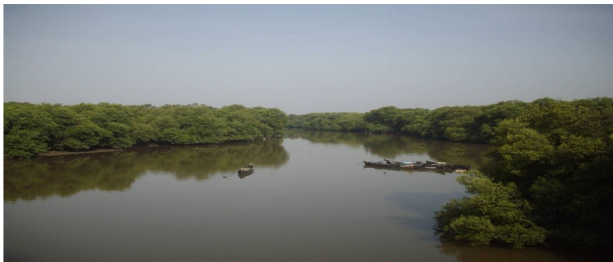
Figure 1 Vashi creek and its surroundings.

The Vashi creek has its origin from Thane creek. Thane creek meets Ulhas river in north through a small connection to link it to the Mumbai harbor. However, the creek extends from the river to the Vashi bridge. Due to increased population, rapid industrialization and uncontrolled urbanization, discharge of the waste is expected to bring about the change in quality of water. The present study was conducted to understand the pollution level of Vashi creek by evaluating physico-chemical parameters. During collection of water samples hand gloves were used for safety. Polythene bottles were used for water sampling and samples were collected from Sector 8, Vashi, Navi Mumbai. It is located in 19° 4' 31.37" N latitude and 72° 59' 6.75" E longitude. The area under study is shown in below figure 1.