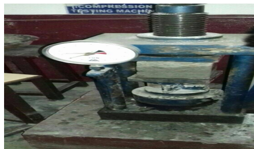
Fig.1. Compressive testing machine

The concrete block of dimension 150x150x150 mm is made using the different percentage of waste glass. The compressive strength of block is tested using the compressive testing machine. The compressive strength of the block was tested on 7 and 28 days for a mix of 1:1.6:4 at a w/c of 0.48.