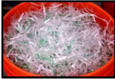
Fig.2. Waste glass.

WATER- This is used to develop adhesion and used to form the paste. Water is also used for the purpose of curing.