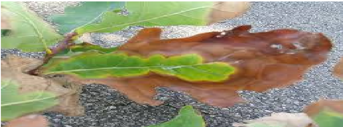
Fig. 3: Early scorch image

The first phase is the image acquisition phase. In this step, the images of the various leaves that are to be classifiers are taken using digital camera. In the second phase image pre-processing is completed. In the third phase, segmentation using GA-SVM is performed to discover the actual segments of the leaf in the image. Later on, feature extraction for the infected part of the leaf is completed based on specific properties among pixels in the image or their texture. After this step, certain statistical analysis tasks are completed to choose the best features that represent the given image, thus minimizing feature redundancy. Finally, classification is completed using GA-SVM.