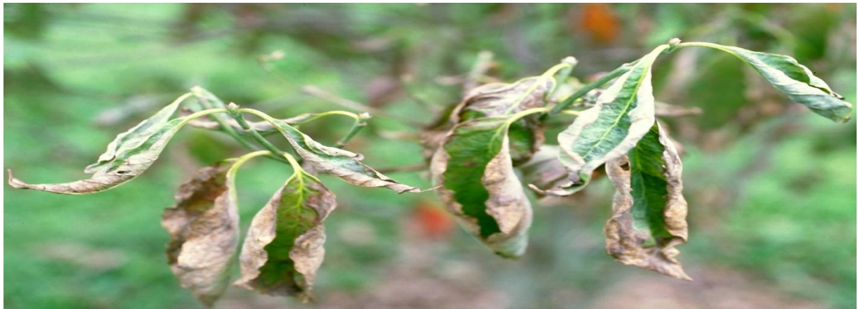
Fig. 2: An example of the output of GA-SVM for leaf that is infected with early scorch disease

The next step in our proposal is that we apply device-independent color space transformation, which converts the color values in the image to the color space specified in the color transformation structure. The color transformation structure specifies various parameters of the transformation. A device dependent color space is the one where the resultant color depends on the equipment used to produce it. For example the color produced using pixel with a given RGB values will be altered as the brightness and contrast on the display device used. Thus the RGB system is a color space that is dependent. To improve the precision of the diseases detection and classification process, a device independent color space, the coordinates used to specify the color will produce the same color regardless of the device used to draw it.