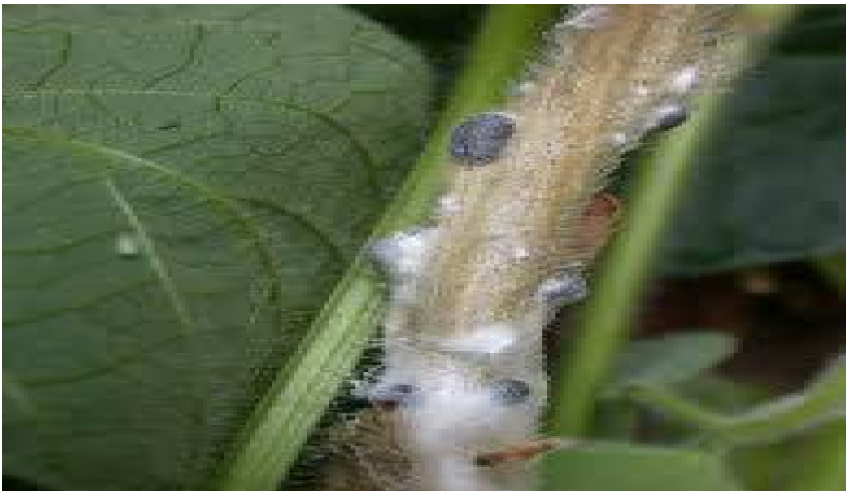
Fig.1.plant stem is infected by white mold disease

Bauer et al. (2015) the authors have worked on the development of methods for the automatic classification of leaf diseases based on high resolution multispectral and stereo images. Leaves of sugar beet are used for evaluating their approach. Sugar beet leaves may get infected by several diseases, such as rusts ( Uromycesbetae ), powdery mildew ( Erysiphebetae ). The developed system classifies the leafs at hand into infested and not-infested classes. Compared to the work of Bauer et al. (2014), our system can: 1. Identify disease type in addition to disease detection. 2. Be directly expanded to cover even more diseases. 3. Detect diseases that infect plant leaves and stems. Our proposal can identify and classify diseases that infect the stem part part of plants as well. Figure 1 shows an example of such infection cases.