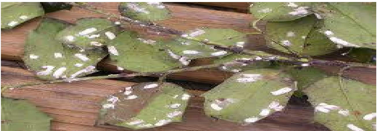
Fig 5: Cotton mold image