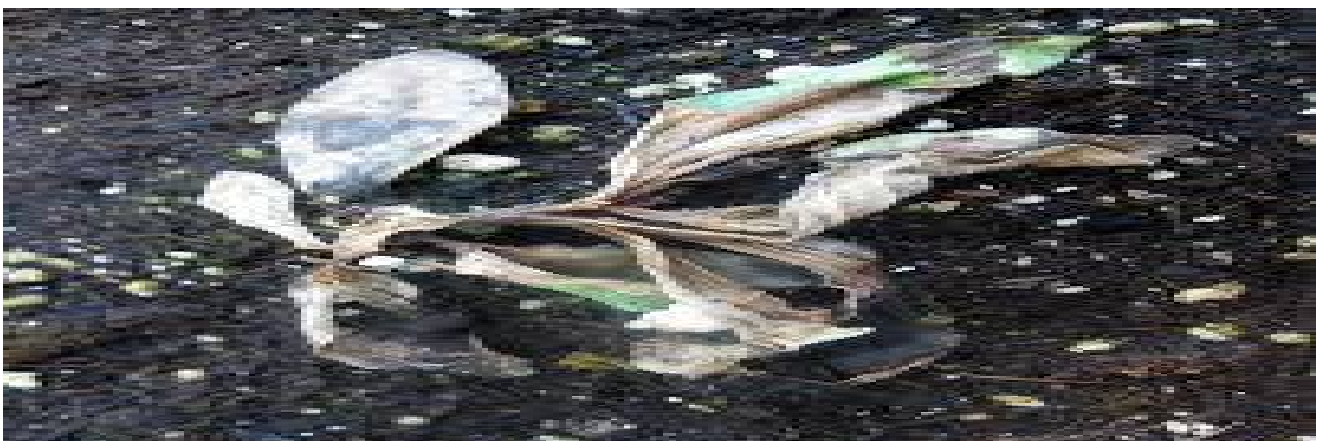
Fig 6: Ashen mold image