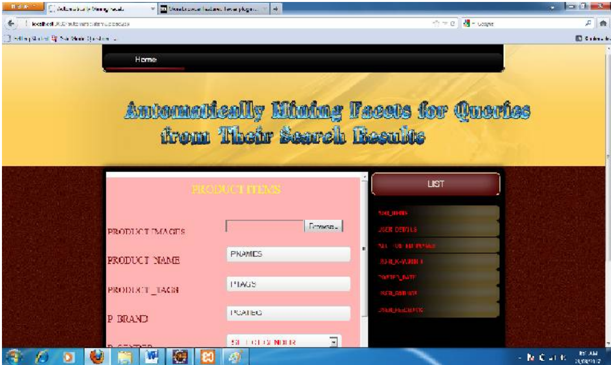
Fig2: Adding Products by Admin